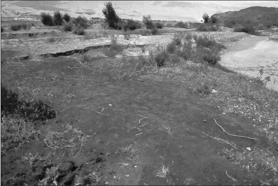
Fig. 2: Habitat of Cylindera (Eugrapha) sublacerata levithoracica in the Aras inundation floodplain west of Kağızman (Kars prov., eastern Turkey).