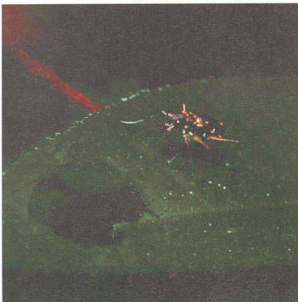
Fig. 2. Odontocheila chrysis (FABRICIUS, 1801) on leaf.