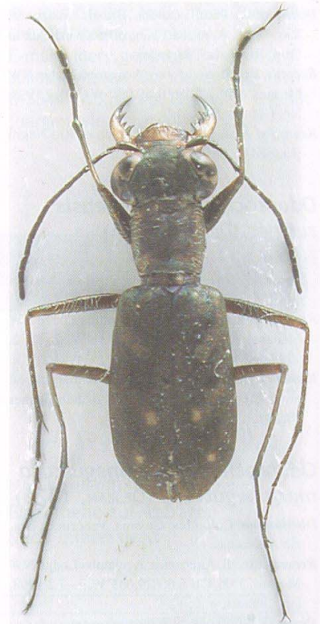
Fig. 5. Brasiella (Brasiella) bororo sp. nov. holotype ♂.