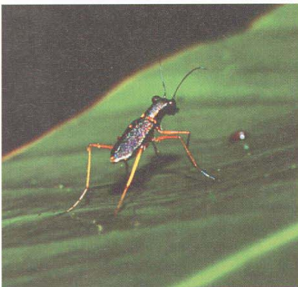
Fig. 1. Odontocheila cayennensis rufipes (DEJEAN, 1825) on leaf.