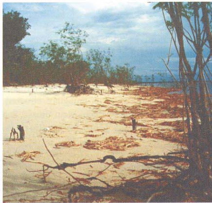
Fig. 3. Location at Rio Negro, Acajatuba Lodge.